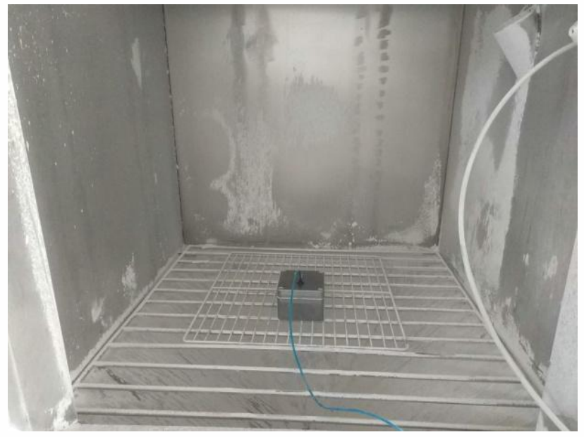
Test Set-up Photo